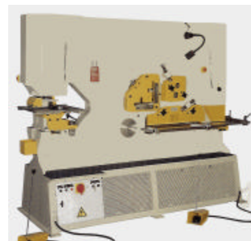
Our Iron Worker

Value added processing services to help meet your requirements.