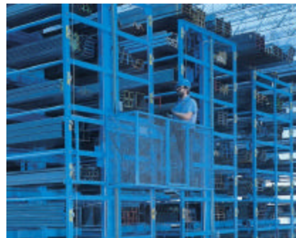
A STATE OF THE ART Steel Service Center